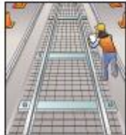
Construct streetcar tracks