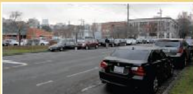
14th & Washington in the Central Area