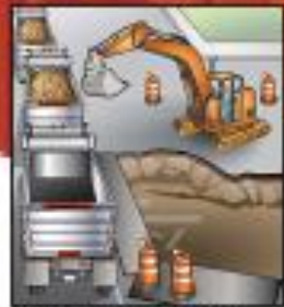
Remove existing roadway