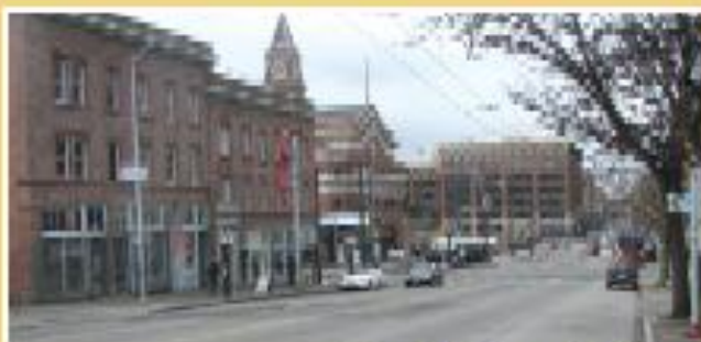
5th & Jackson in Chinatown International District