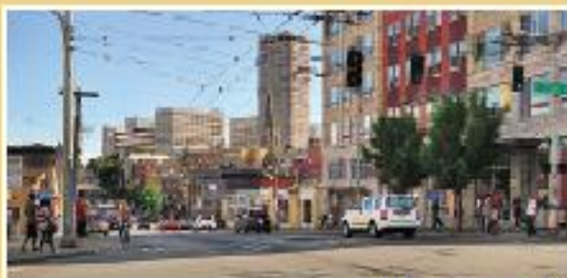
Broadway & Pine on Capitol Hill