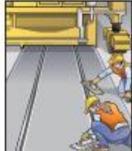
Pour concrete track slab