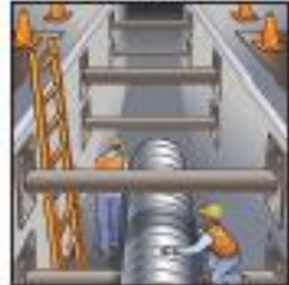
Install underground utilities