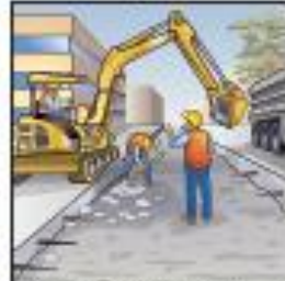
Excavate trackway trench