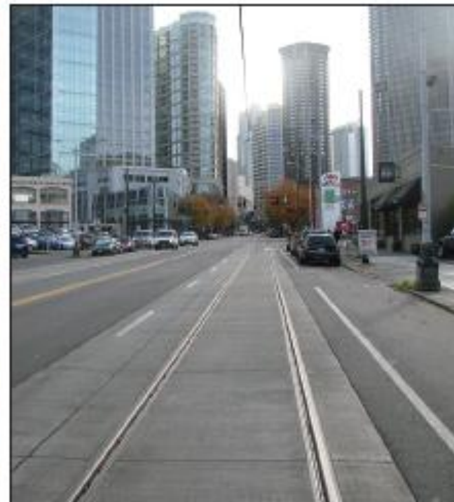
Finished streetcar track in Seattle with final paving and striping