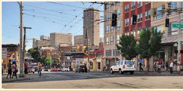
Broadway & Pine in Capitol Hill