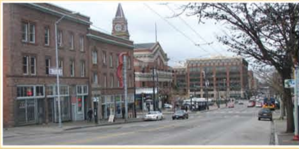
5th & Jackson in Chinatown/International District