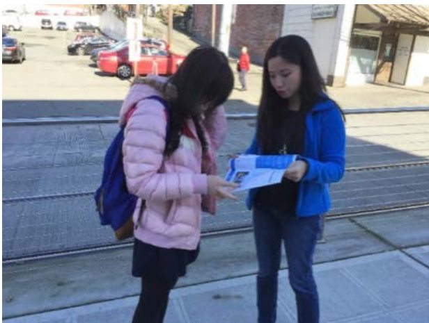
City Center Connector Outreach Team members talked with passengers at the Japantown Streetcar Station

The Center City Connector team has been spreading the word about the project. This fall, we talked with over 900 people at 19 outreach events in South Lake Union, Chinatown-International District, Pioneer Square, and Downtown. We visited neighborhood organizations, engaged business owners and residents by going door-to-door, and held pop-up sessions at Westlake Park, Pike Place Market, Japantown, and the Harbor Steps during lunch hours.