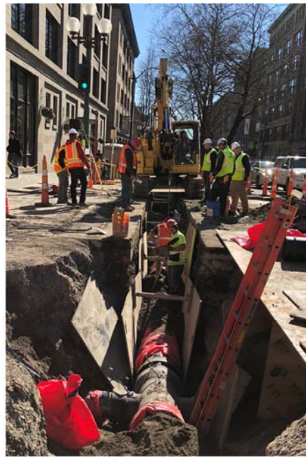
Crews installing the first section of new, earthquake-resilient water main in 1st Ave S at S Jackson St