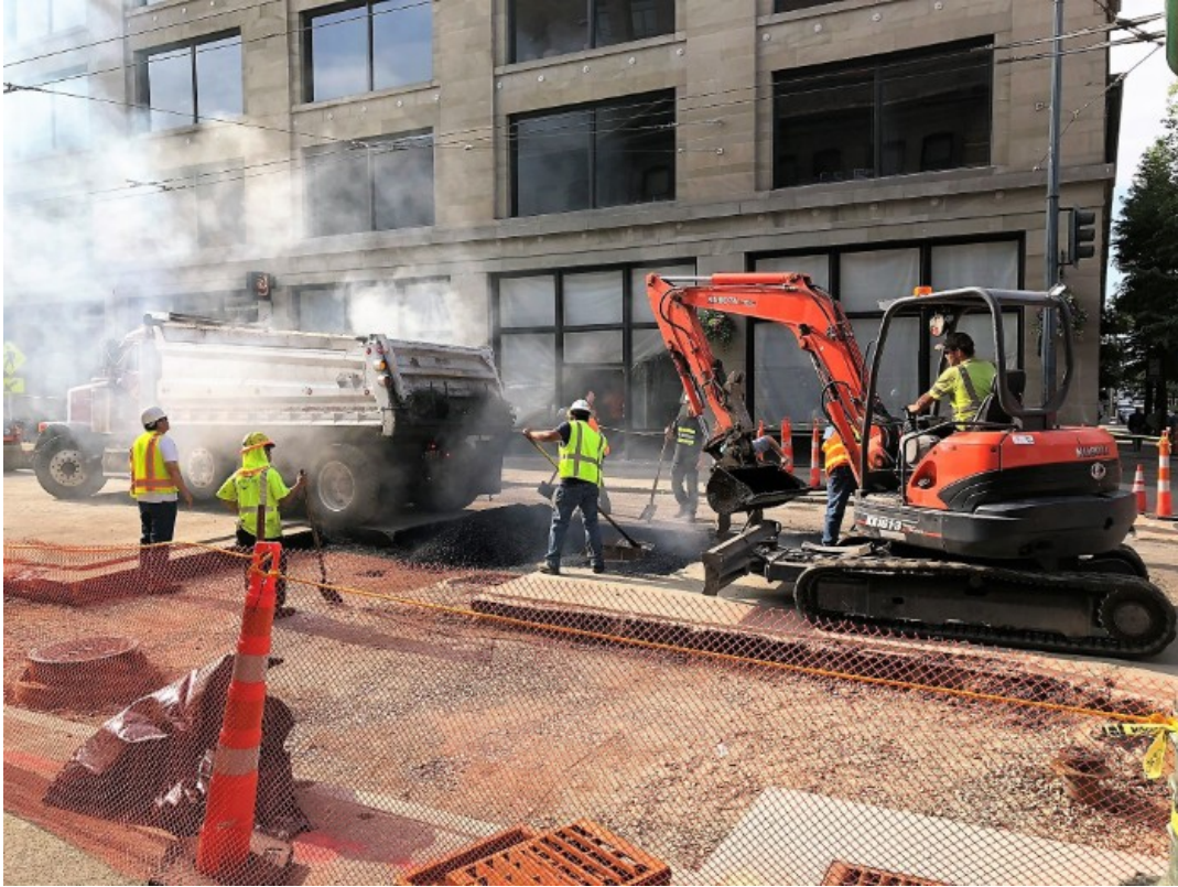
Installing asphalt paving on S Jackson St just east of 1st Ave S.